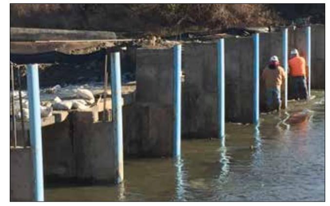
While the emergency work of reinforcing the structure of Sack Dam was being completed, the height of the Dam was raised several feet.

The Water Board's December meeting was the first opportunity for the Board members to view the voluntary settlement agreements since the various groups developed the final